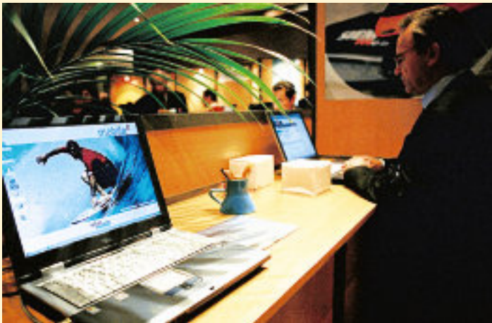
Siemens Internet café 2003